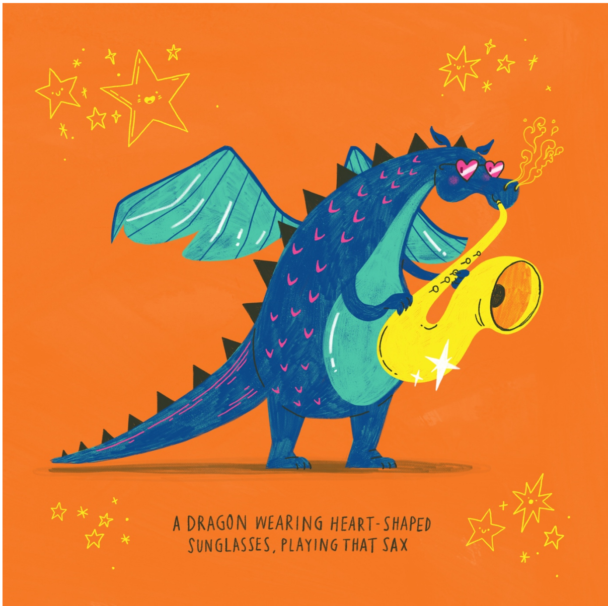
A DRAGON WEARING HEART-SHAPED SUNGLASSES, PLAYING THAT SAX