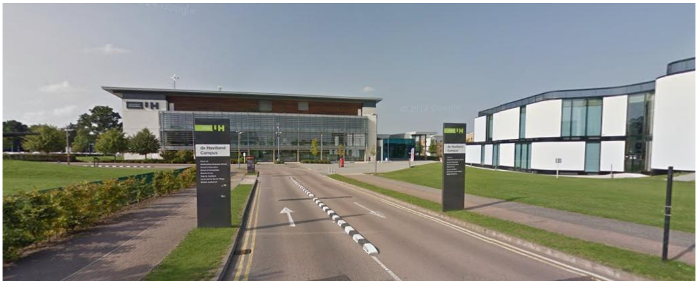
De-Havilland entrance, University of Hertfordshire